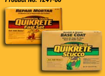
QUIKRETE® Base Coat Stucco >> Product No. 1139-80

QUIKRETE® FastSet Repair Mortar >> Product No. 1241-60